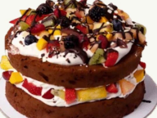
Victorian Chocolate 150.00 AED