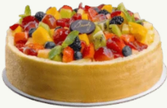
Custard Cake 200.00 AED

Indulge in our signature delights—freshly baked breads, cakes, and pastries made with love. Explore our handcrafted collection, perfect for everyday treats or special occasions.