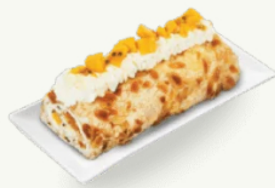
Mango Passion Roll 200.00 AED