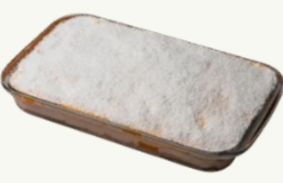
Coco Mango 250.00 AED