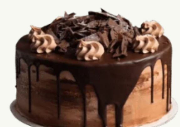
German Chocolate 200.00 AED