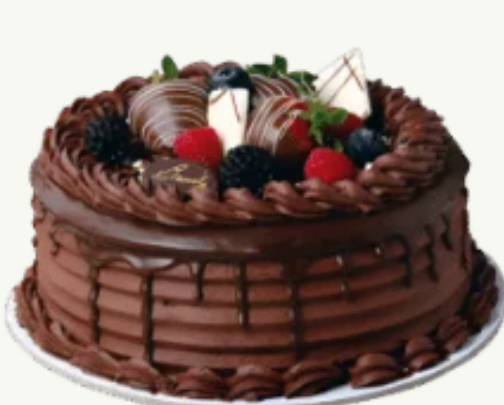
Dark Fudge 150.00 AED