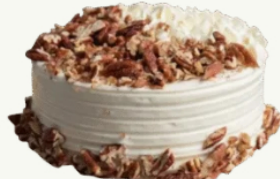
Carrot Pecan Cake 200.00 AED