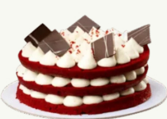
Red Velvet 150.00 AED